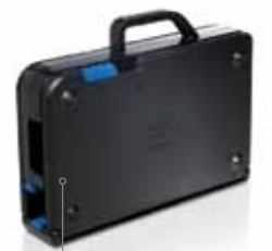
The Intel Portable Capture Station folds up for portability or storage